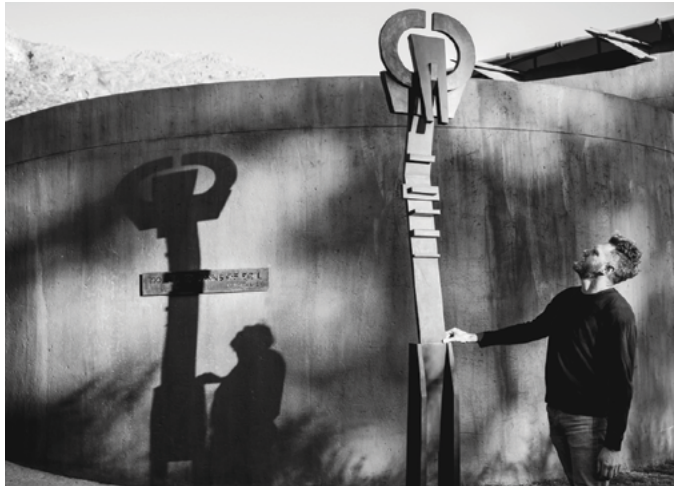
Louis Olivier with steel sculpture, A Place Of Contested Boundaries