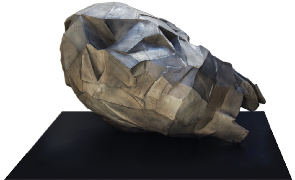
Fragments Of A Soul , Bronze, 1530 x 1070 x 725cm

Visits to the Dylan Lewis Sculpture Garden are by appointment only, please contact info@dylanart.co.za or 021 880 0045 to make a booking.