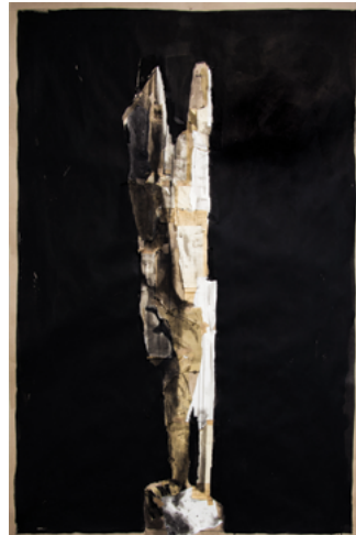
Asylum Seeker , Collage

100 GENERATIONS OF SOIL – a solo exhibition of sculptures and mixed media drawings - remains installed at the Dylan Lewis Sculpture Garden in Stellenbosch throughout the Summer.